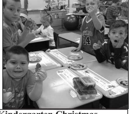
Kindergarten Christmas Concert

WINTER IS COLD THERE IS SNOW IN THE SKY THE SQUIRREL GATHER NUTS AND THE WILD GEESE FLY THE FLUFFY RED FOX HAS HIS FUR TO KEEP WARM THE BEAR'S IN HER CAVE SLEEPING ALL THRU THE STORM