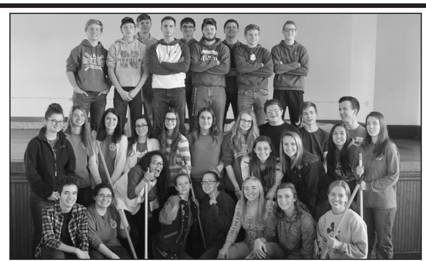
Northwestern HS National Honor Society following their group service project at the West Salem Town Hall on 11/29/17.